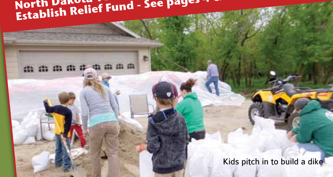
Kids pitch in to build a dike