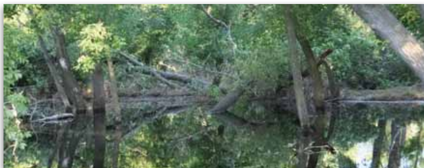
Back yard trees topple over in soggy ground